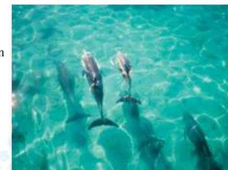
Dolphins lead the way.