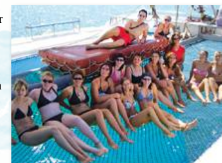
Get on the net.