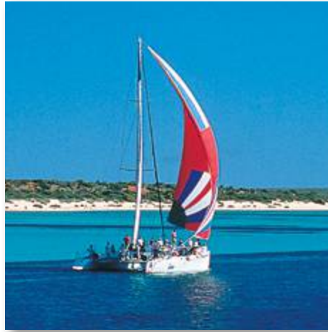
“Shotover” - wildlife, sailing & fun.

You’ll be sailing a famous champion, the fastest sailing cruise boat in the country and still one of the fastest ocean racing cats in the southern hemisphere.