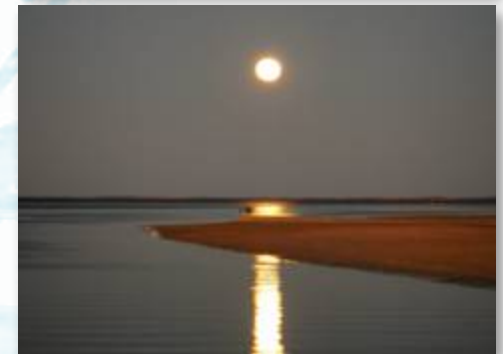
Sunset West - Moonrise East

Large, cool shade awning & ringside seats all round for everyone.