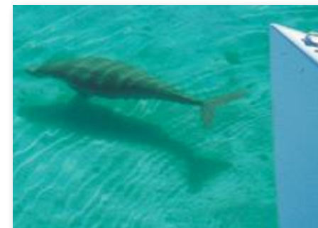
Dugong in crystal shallows.

Best for the animals - best for the planet - best for you.