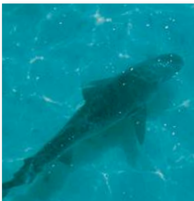
An awesome 3 metre tiger shark.