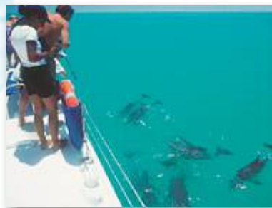
Dolphins in focus