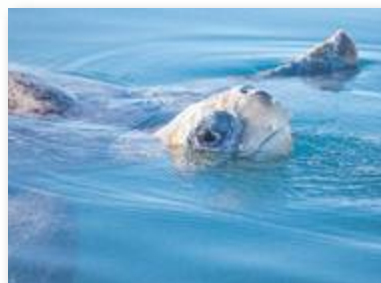
Old Man Loggerhead