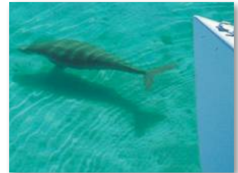
Dugong in crystal shallows.