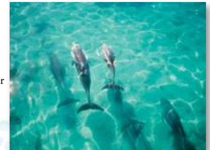
Dolphins lead the way.