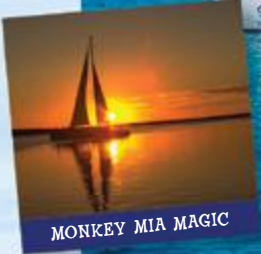
MONKEY MIA MAGIC