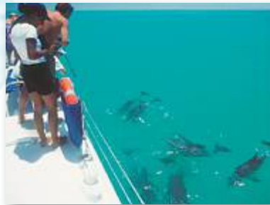
Dolphins in focus