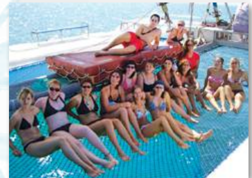
Get on the net

Large, cool shade awning & ringside seats all round for everyone.