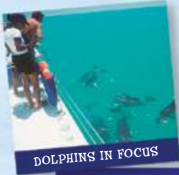
DOLPHINS IN FOCUS