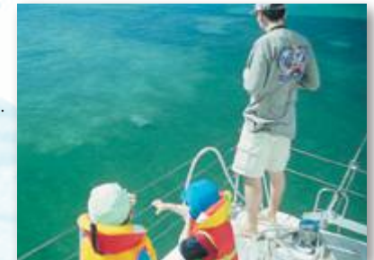
Waiting for a turtle breath.

Best for the animals - best for the planet - best for you.