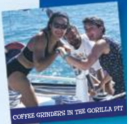
COFFEE GRINDERS IN THE GORILLA PT